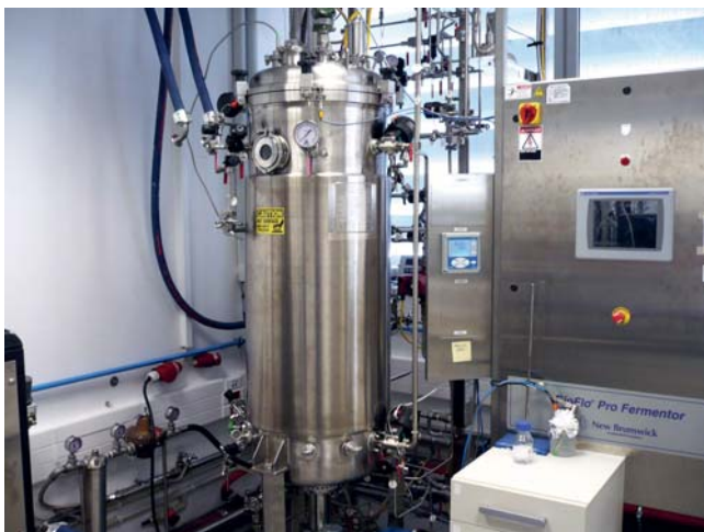
Scale-up trials: 250L fermenter (BIOTREND)

Scale-up trials are underway to transfer the fermentation technology from lab-scale to industrial application. The process developed at lab scale by ULUND will be implemented at pilot scale at BIOTREND. The resulting scaled-up process will be transferred to Borregaard's demo plant. Synergies between partners will be instrumental for a successful scale-up of the fermentations using real raw materials and in conditions suitable for downstream processing.