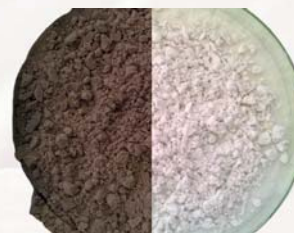
Dicarboxylic acid-containing solids with (left) and without (right) lignocellulosic impurities (BIOTREND)

The development of a downstream processing method for the recovery of bio-based dicarboxylic acids faced many challenges to reach the purity standards suitable for polymerization. A multi-stage approach was developed to overcome the issues posed by the high amount of lignocellulosic impurities in the fermentation broth and by the fermentation by-products. Recovered solids from complete process experiments showed that purity specifications were achieved in high product yield. The optimization efforts in recycling and re-use of streams reduced the economic and environmental impact of the process.